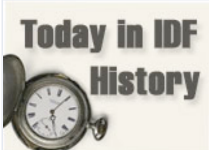
Today in IDF History Historical Events